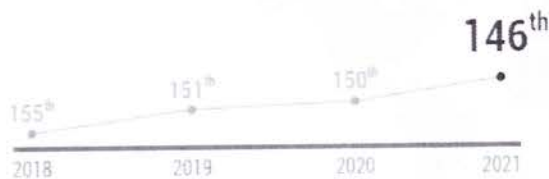
2021 QS Global University Ranking